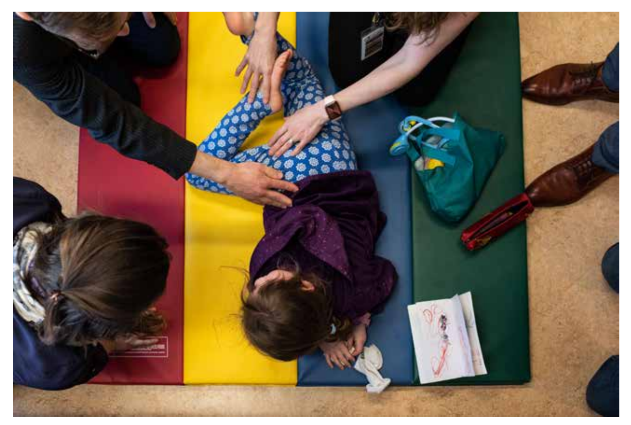
Multiple specialists assess a young girl's hip mobility during a day of appointments.

"We can't work. We can't contribute to a pension plan. We can't get a mortgage. We can't save any money," she points out. "We are unpaid caregivers, and therefore our ability to work is severely limited. We represent an extremely vulnerable population. No one recognizes our level of distress and suffering."