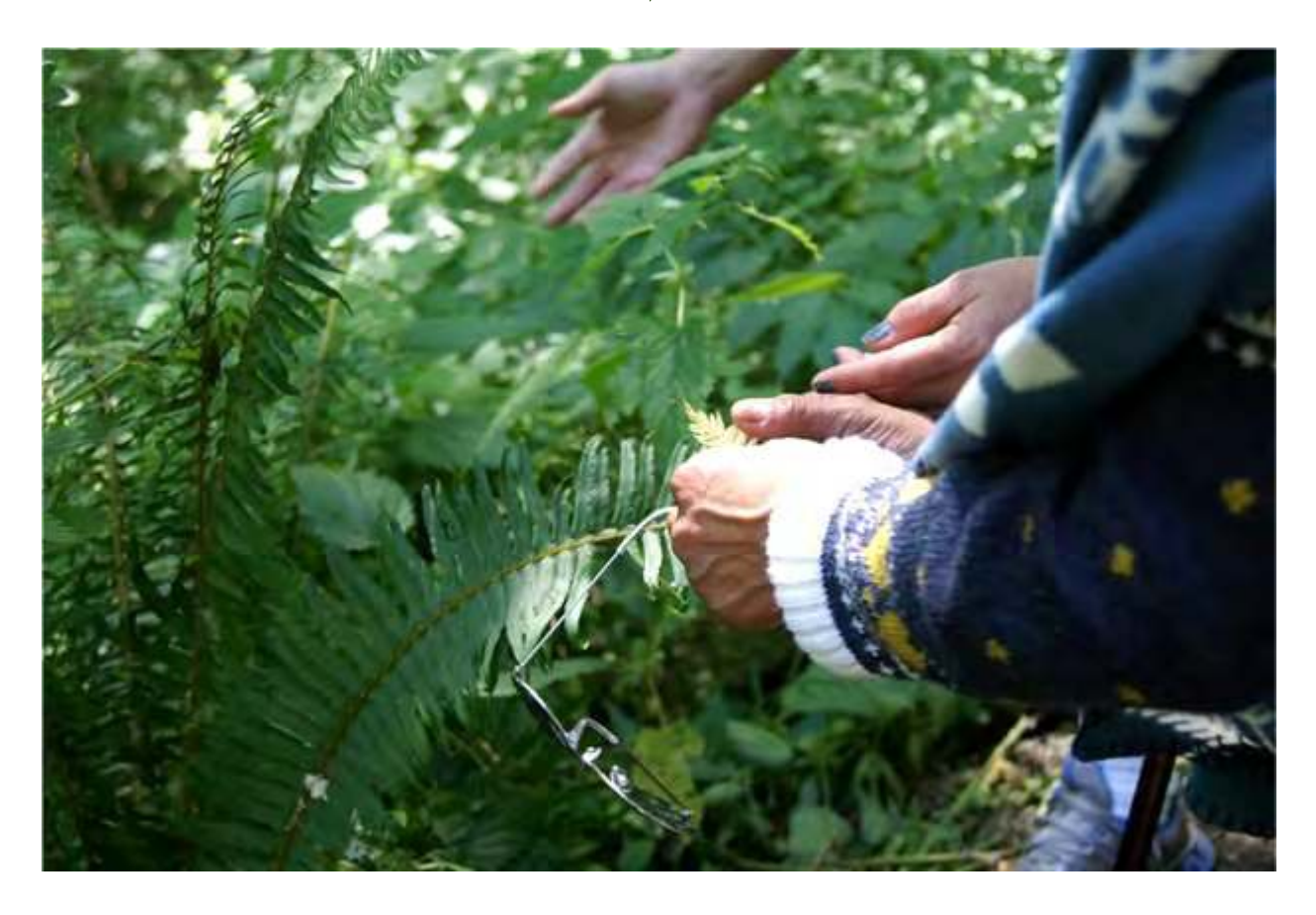
Aboriginal Coalition to End Homelessness 2018