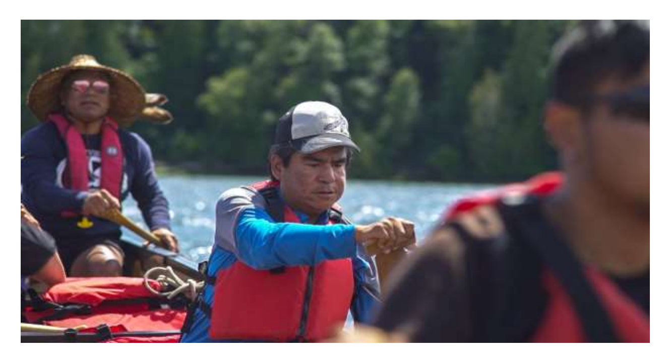
"The water, I left it all out on the water - I didn't bring anything back with me."

Thank You to Vancouver Island Health Authority/Aboriginal Health Initiative Program. This work would not be possible without your financial support.